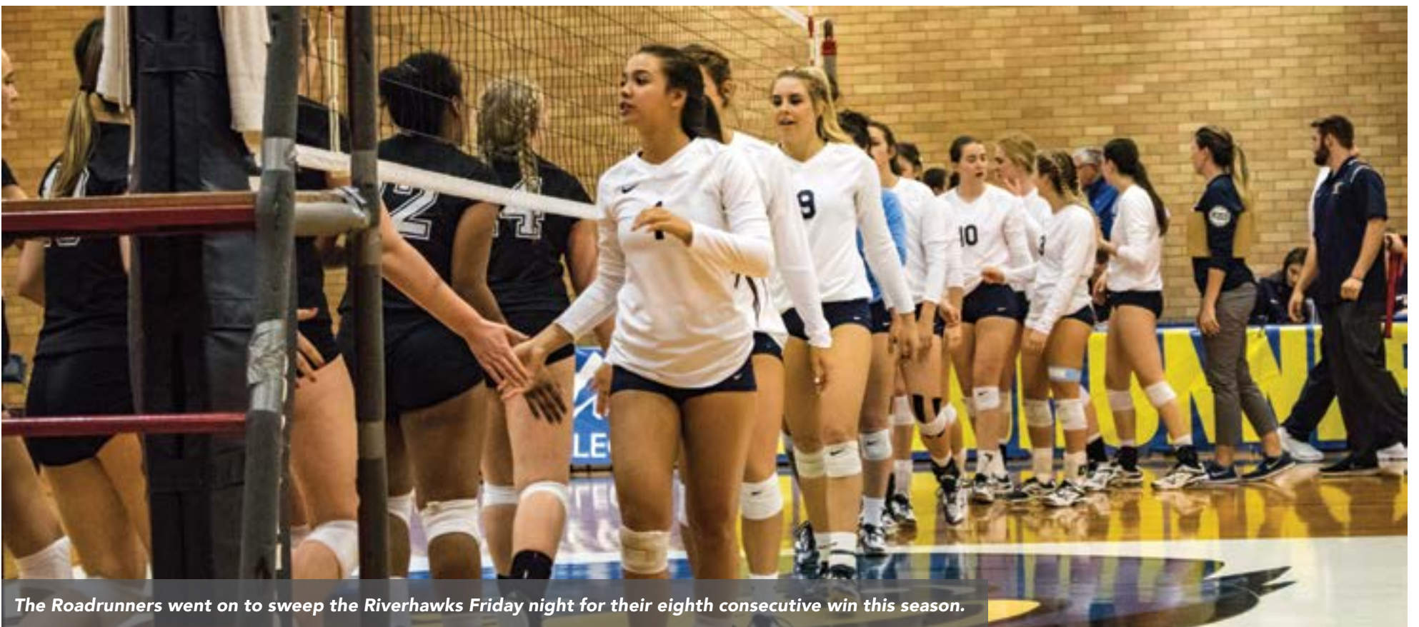
The Roadrunners went on to sweep the Riverhawks Friday night for their eighth consecutive win this season.