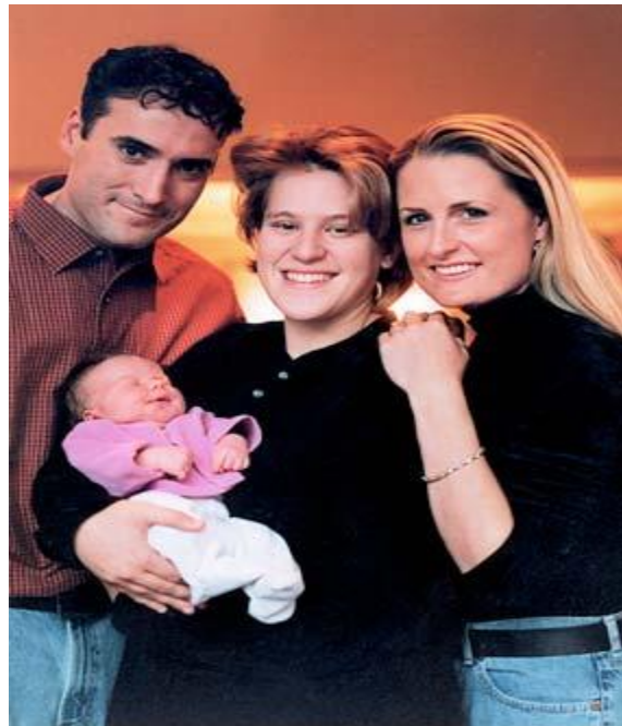
Figure 1.1 A picture of an adopted family with the biological mother (Encarta) Photo by Edmund Keene

Restricted Open Adoption is when the biological and adoptive families never actually meet. They share information through a mediator for as ever long as they see fit. This form of adoption is chosen so that the adoptive child can get the information that he or she desires and the biological parent can keep track of How their child is doing.