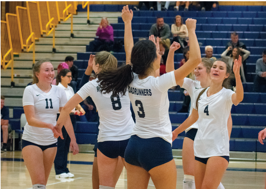
High fives are shared in celebration by the Roadrunners team after their 3-0 victory against the Clackamas Cougars.