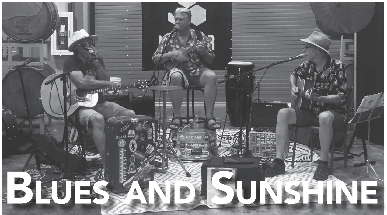
LBCC Benton Center Acoustic Showcase hosts "Blues and Sunshine" October 18