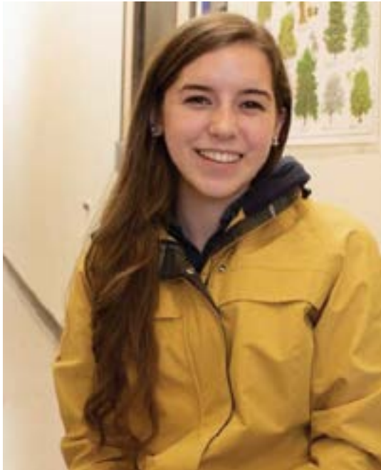
STORY AND PHOTO: NATALIE DUMFORD