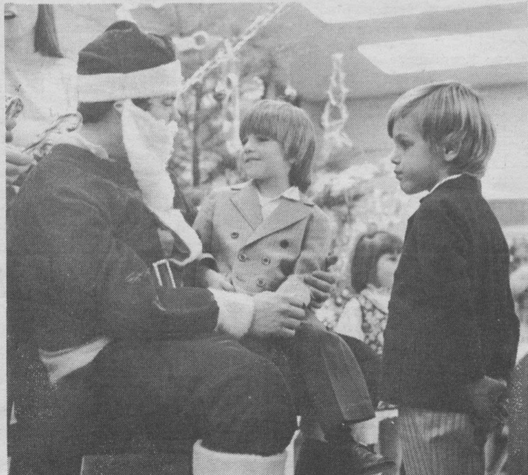
Waiting impatiently for a visit with the "Jolly Old Man."