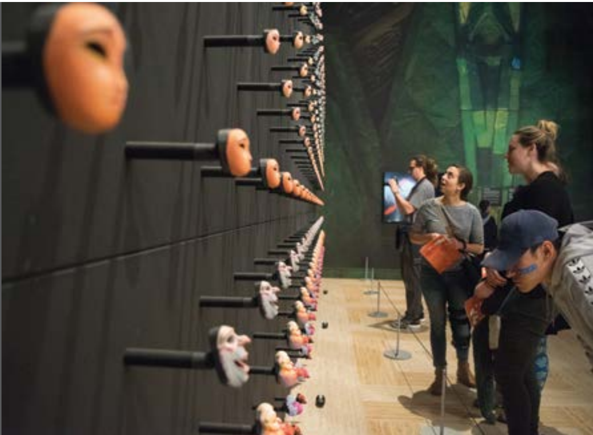
Laika studios, a popular animation house based in Portland, is currently exhibiting their work at the Portland Museum of Art. Laika is the backbone behind productions such as, "Kubo and the Two Strings," "Coraline," and other movies where much of the set is designed by hand.