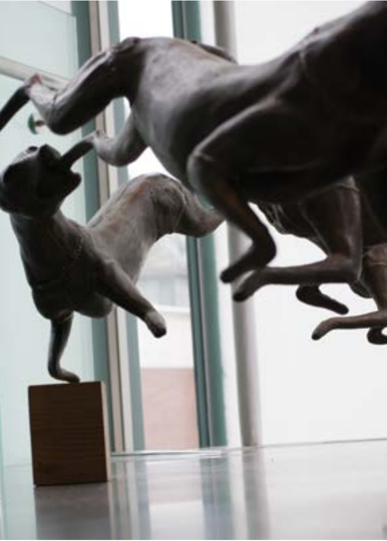
"Fox Wheel" by Bruce Nauman is one of many works displayed in the Portland Art Museum that students were given the opportunity to view.