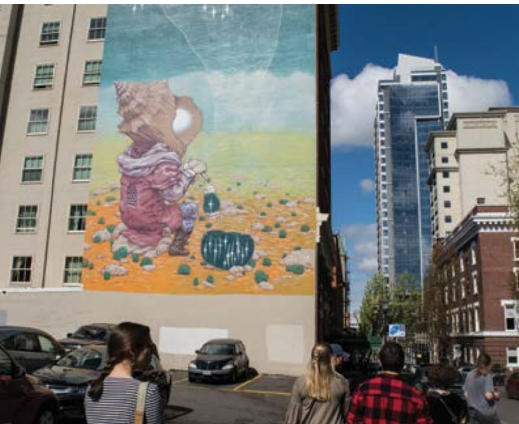
After viewing works in Portland Art Museum, members of the Public Art class walked around Portland to critically assess parameters that currently exist between environment, art and audience.