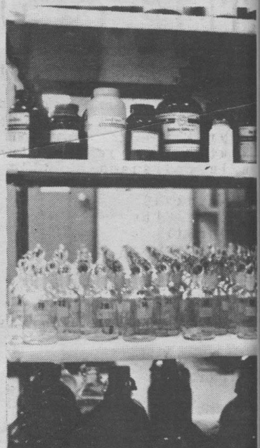
Tools for the trade

The actual monitoring of air and water samples was part of last year's course, but the increased need for actual job training took the place of the more general academic classes. There will, though, be an Ecology course offered spring term open to all interested students. The course will cover general and Willamette Valley information.