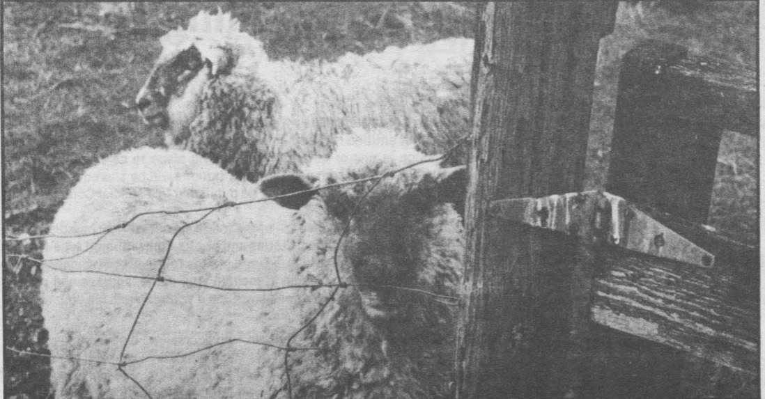
Visitors are welcome at the OSU sheep barn during lambing season, mid-January through March.