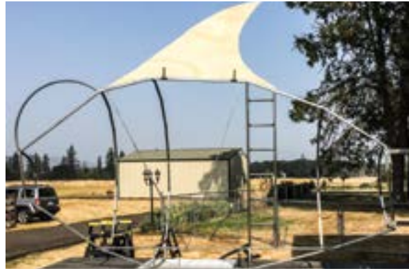
Richard Elvin used CAD to figure out the initial welding of the framework.