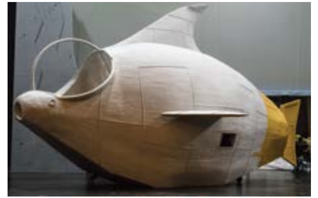
Currently, the body has been filled out and the fins have been attached and is soon to be painted yellow.

are customized to fit the puppeteer before she can add any skin, fur, or final layers that bring each puppet to life.