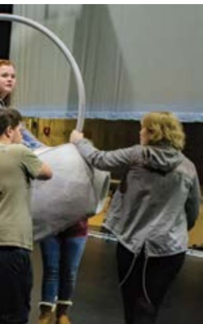
e with passengers in the