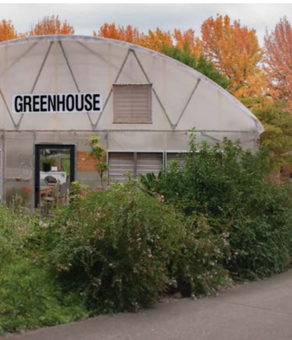
Student Farm is located behind the Luckamiute Center.