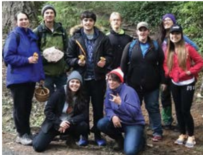
The Horticulture Club