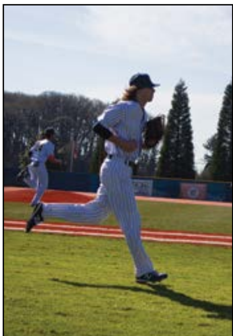
The Roadrunners run to the outfield at the start of a new inning.