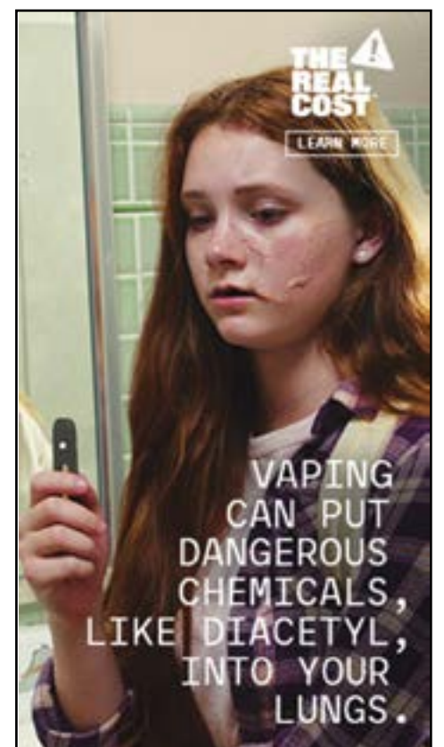
Products containing nicotine are advertised as detrimental for your health, contradictory to how they were advertised in the 1950s.

Many people have struggles with where to begin when it comes to quitting smoking. Above are a few resources to look into if you're interested.