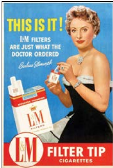
In the 1950s, cigarette advertisements were commonly "doctor recommended" in order to sell more products.