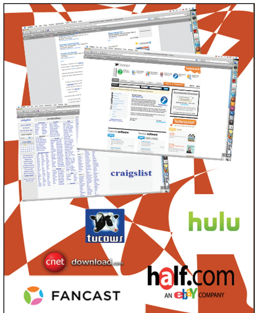
Illustration by Frank Warren

5. Cut the cable. Just keep the broadband. Why hand over your cash to DirecTV, Blockbuster, or Netflix, when you can watch the boob tube and the big screen online for free. Hulu.com and Fancast.com have some decent full-length movies and retro-episodes of your favorite television shows just waiting for you. And it's all very legal, unlike your copy of Transformers II.