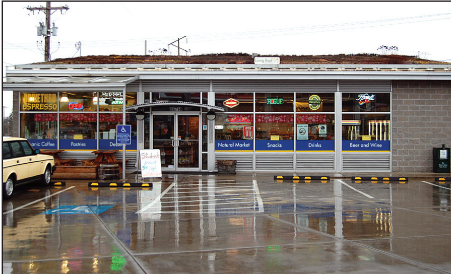
The SeQuential Gas Station entrance

Another way that this station is helping to pro-