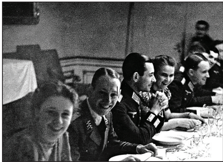
An SS Christmas Dinner circa 1940