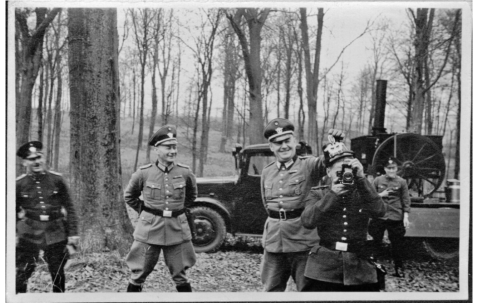
Nazi pranksters pull one over on the German police

Hitler was a painter, and an incredible politician. He was also a madman who helped to perpetrate some of the most horrific forms of torture known to history, but without him the United Nations would not exist. Before WWII, the League of Nations, the U.N.'s predecessor, was largely regarded as President Wilson's ludicrous pipe dream. The events of the war led many to recognize that an international organization was necessary to protect against another event. The United Nations