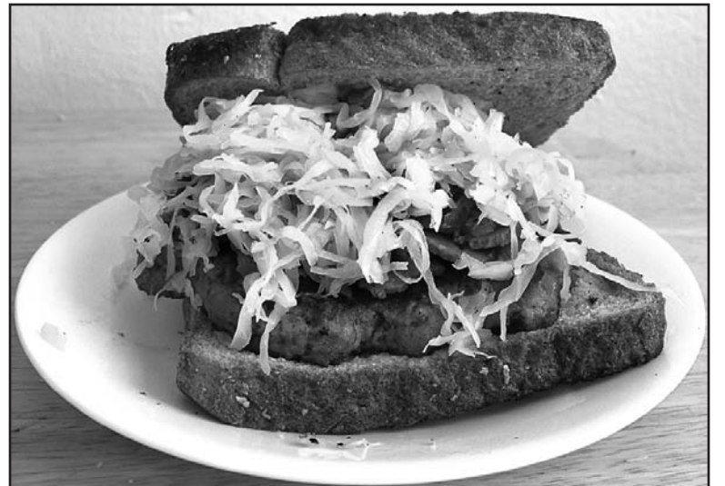
The delicious grilled reuben burger.

Once your burgers are finished cooking, get out your bread, corned beef, butter, and a large pan or griddle top. Start by warming the