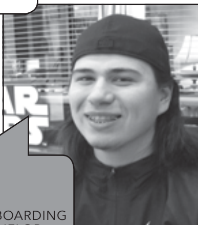
SAUL LOPEZ ENGINEERING

"I GOT TO RELAX, AND TO MESS AROUND WITH A NEW GRAPHIC ART PROGRAM ON MY COMPUTER"