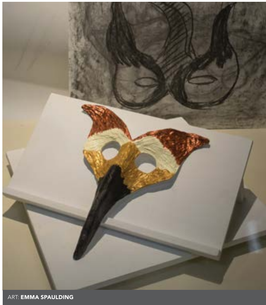
ART: EMMA SPAULDING