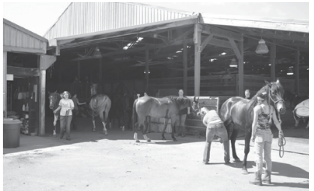
Students get horses ready to be put away after riding at the LBCC Horse Center in Albany, Oregon.