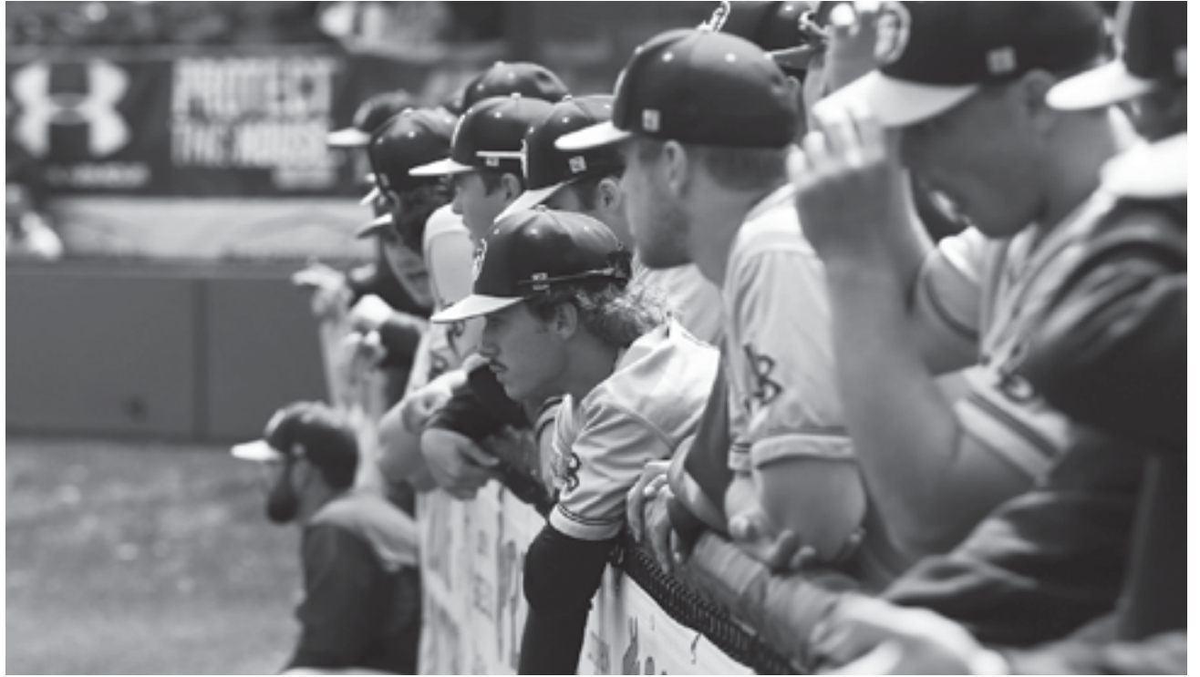
Roadrunners look on eagerly during their elimination game against Edmonds on May 24, 2019.