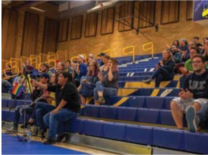
Audience members watch from the bleachers.