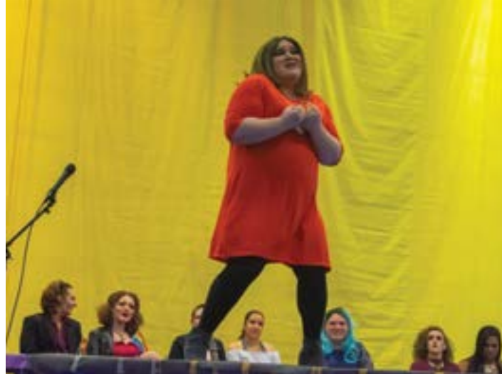
Calliope Carmichaels Phenomenon.